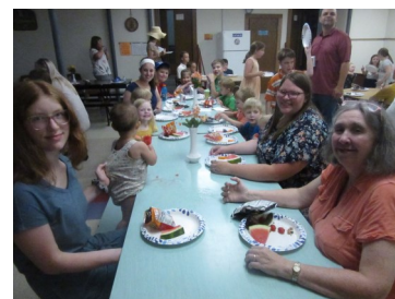
Above : HSA helped make the start of the school year special. They provided a breakfast and gifts for the classroom during the teacher in-service. They also provided the meal for the family picnic before school started