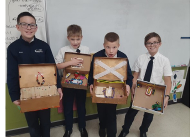
ABOVE: The 7/8 students performing a science experiment BELOW: The 56 boys show off their ancient Egyptian tombs